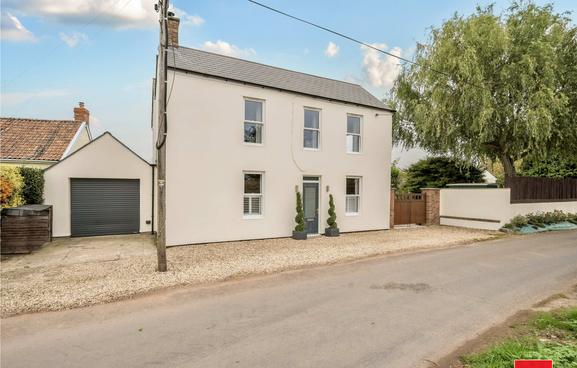
Orchard Cottage Hedging, North Newton TA7 0DF