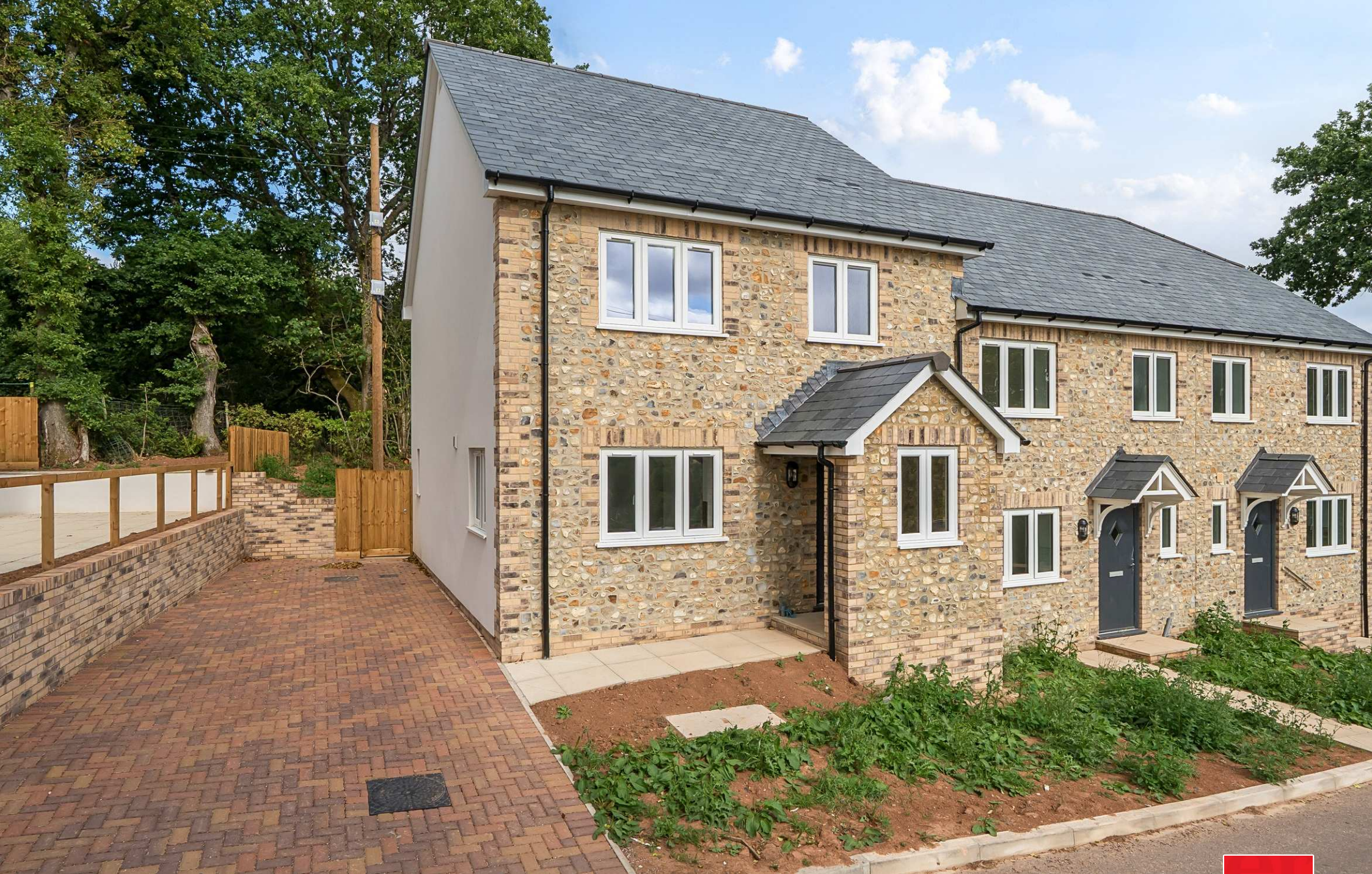
1 Rose Cottage Clayhidon, Cullompton EX15 3QB