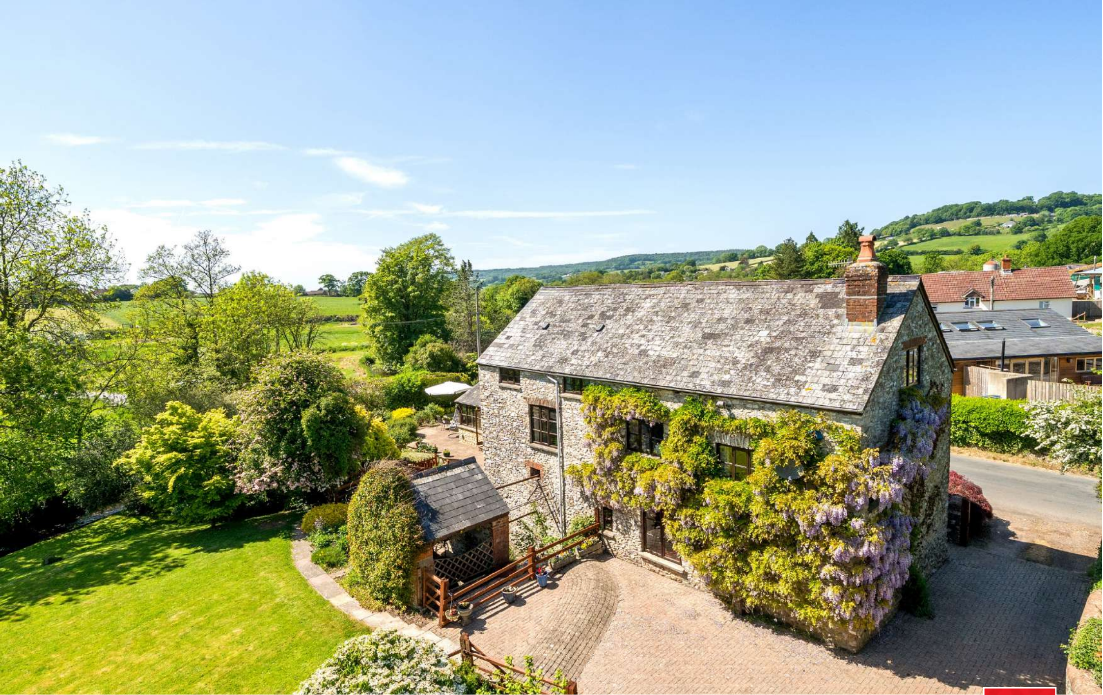
Culmbridge Mill Hemyock, Cullumpton EX15 3PE