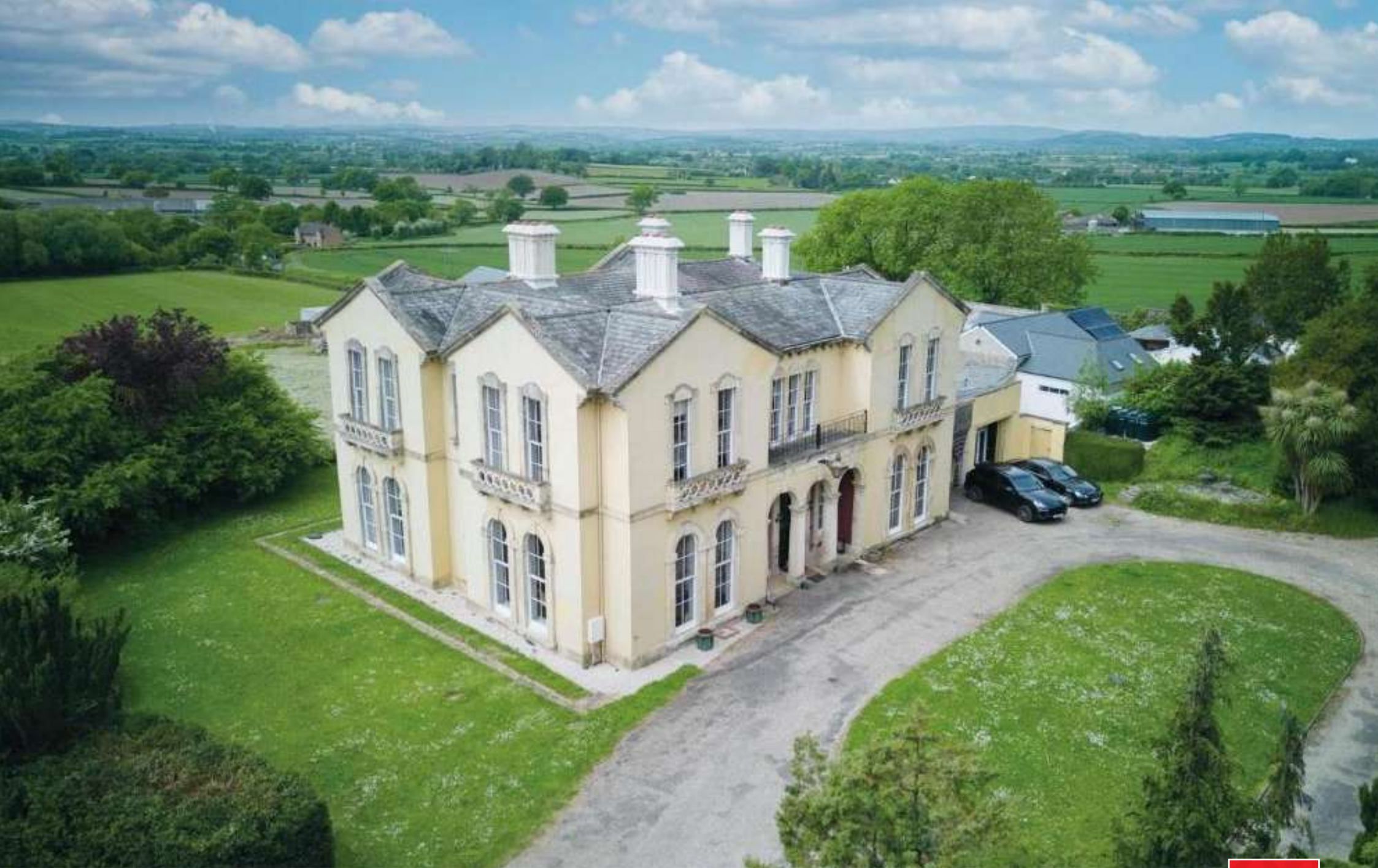
Rumwell Park Taunton TA4 1EH