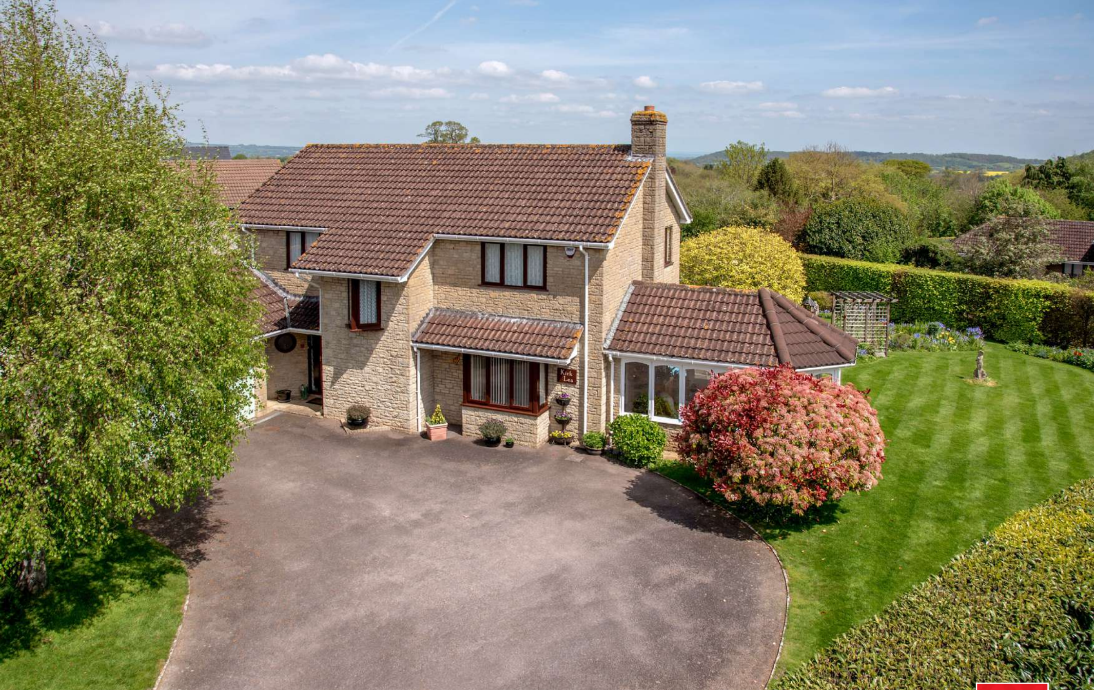
Kirk Lea Mill Lane, Taunton TA3 7AH