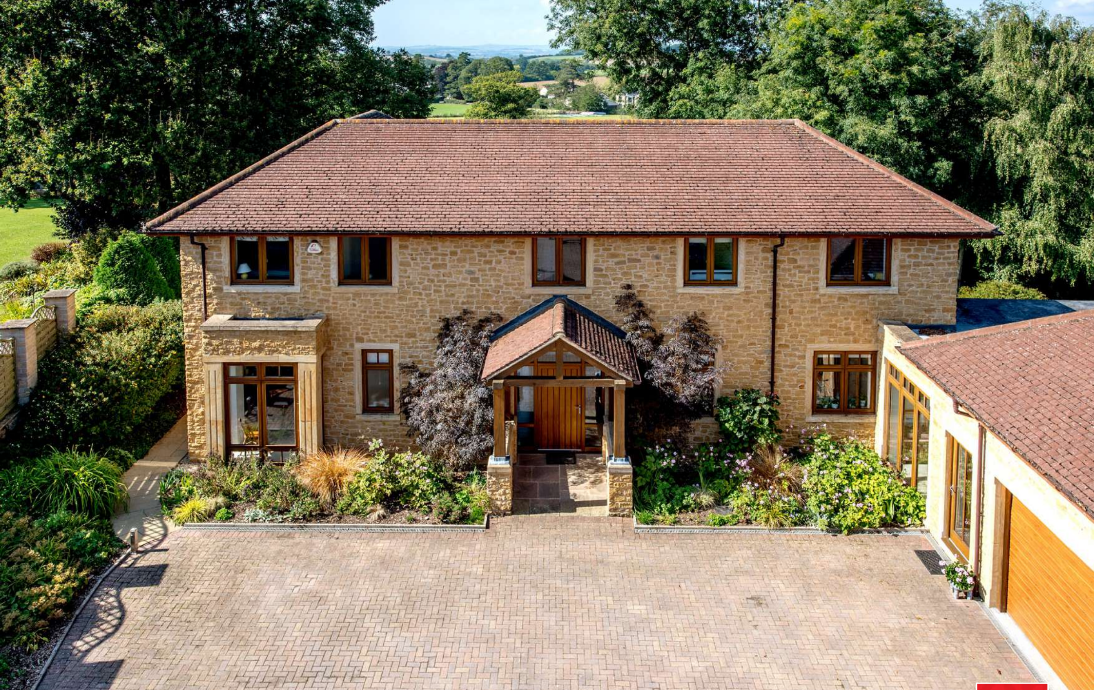
Little Orchard, Gatchell Meadow Trull, Taunton TA3 7HY