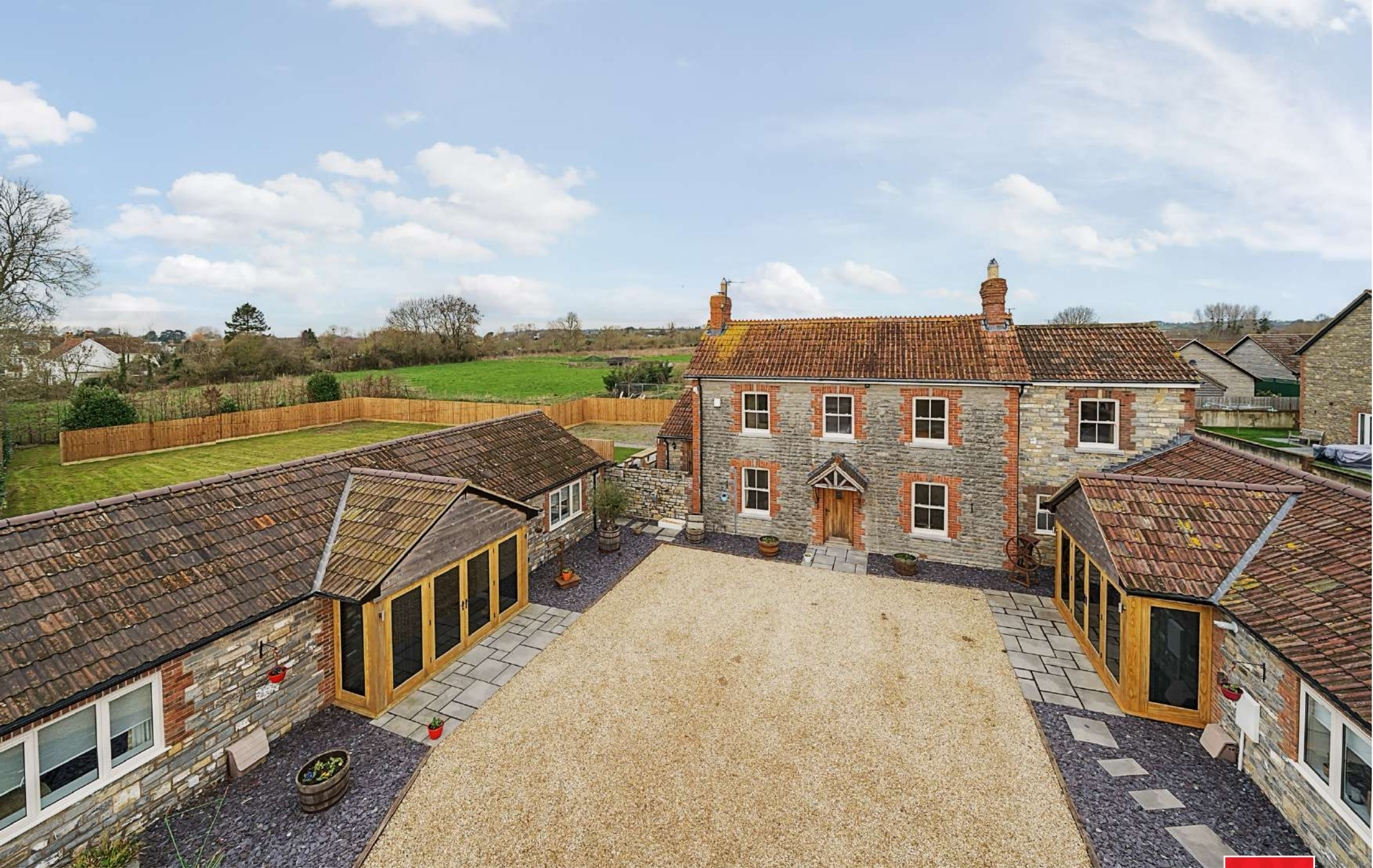
Highfield Farm Windmill Lane, Pibsbury, Langport TA10 9EP