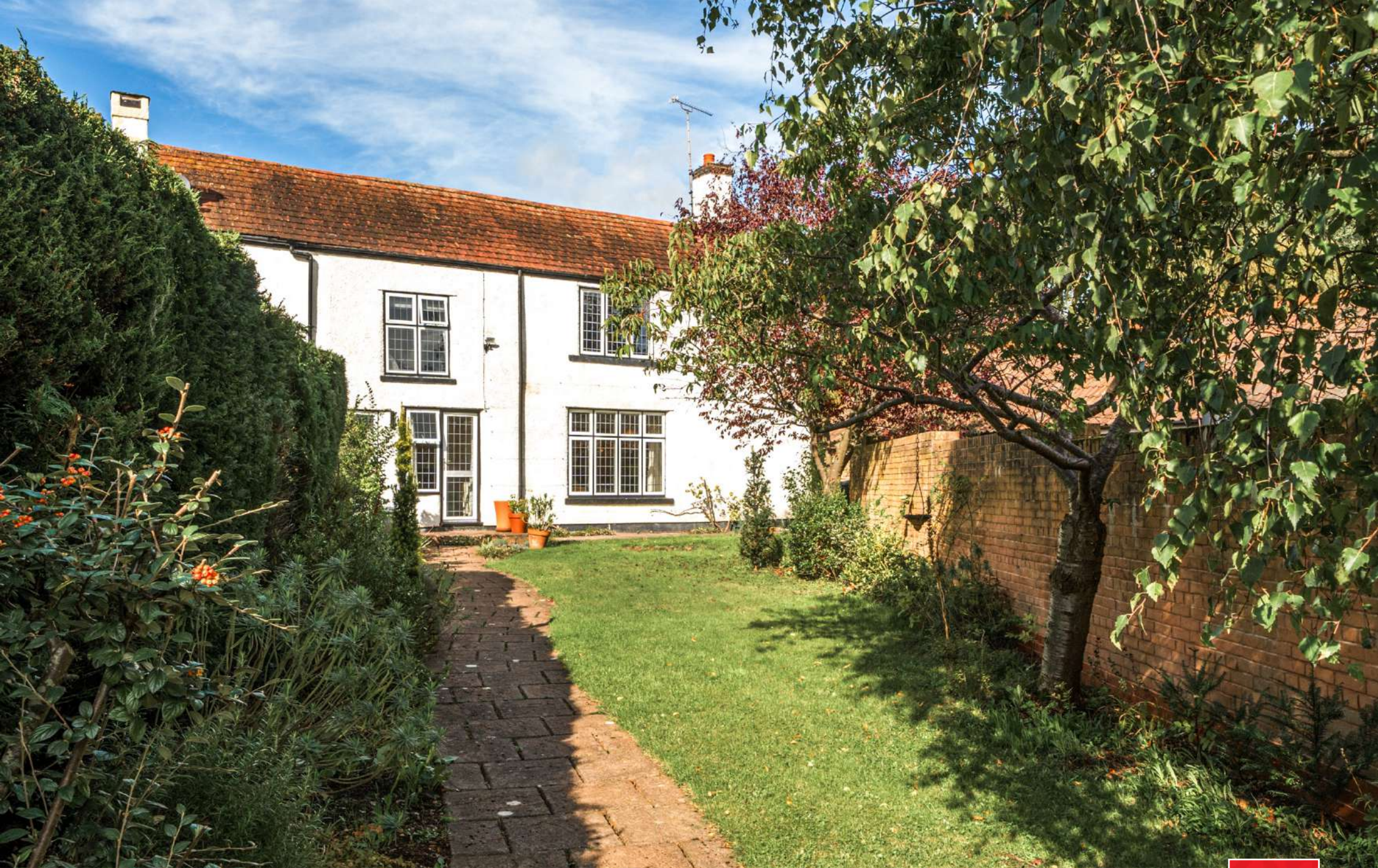
Tudor Cottage Woodland Road, Taunton TA2 7HR