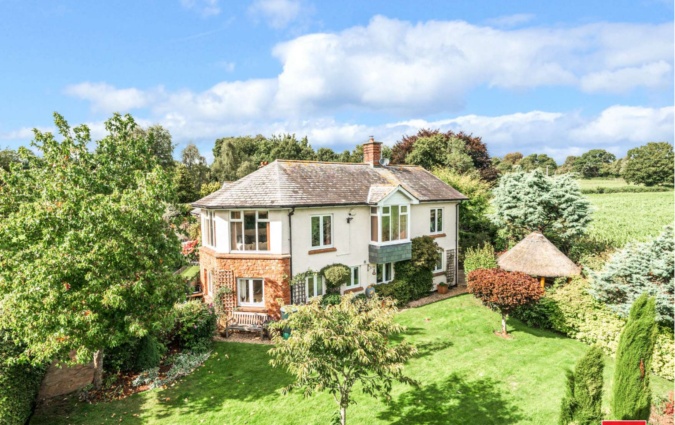
Aldens Lodge Milverton TA4 1NS