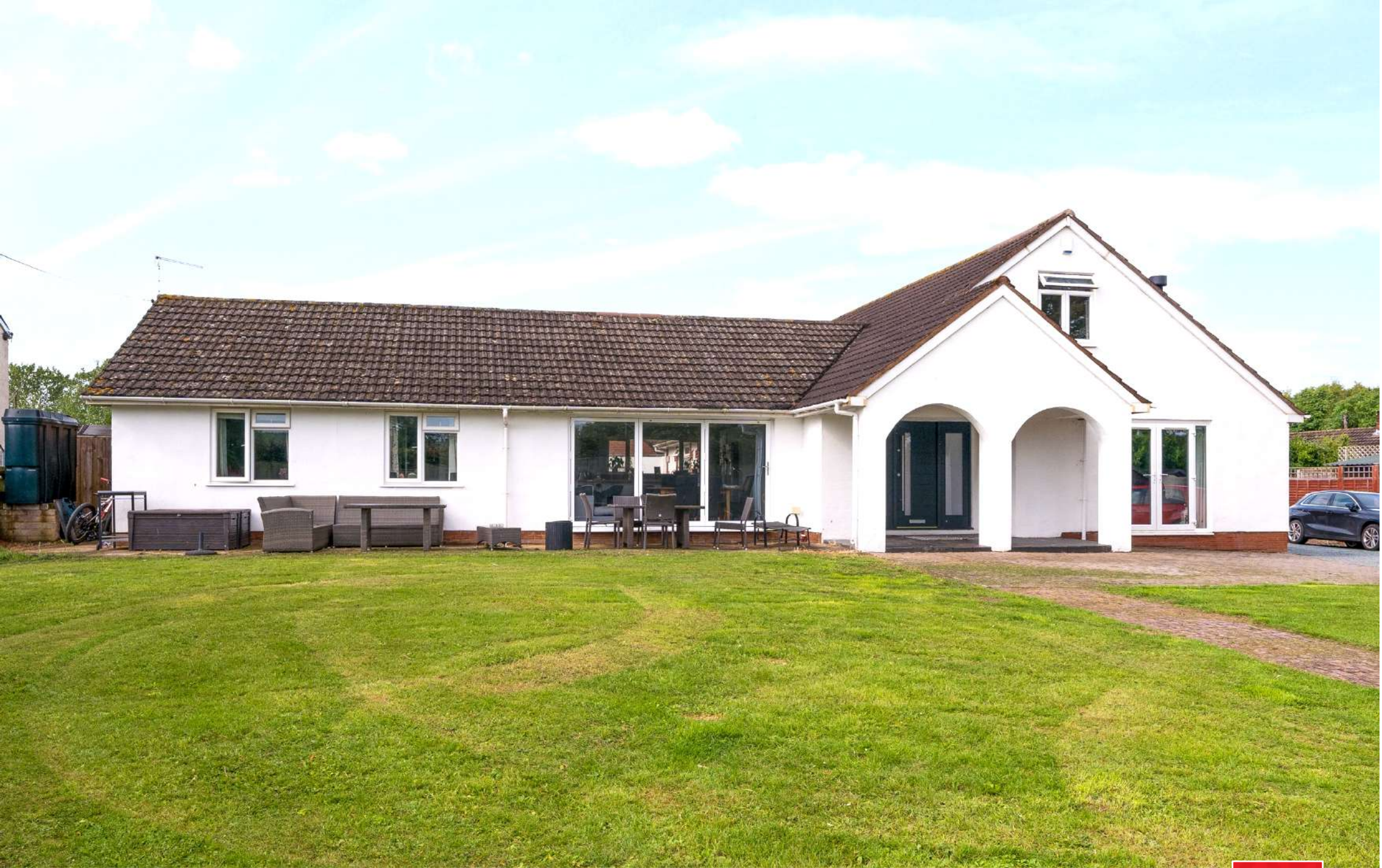
The Range Henlade, Taunton TA3 5DH