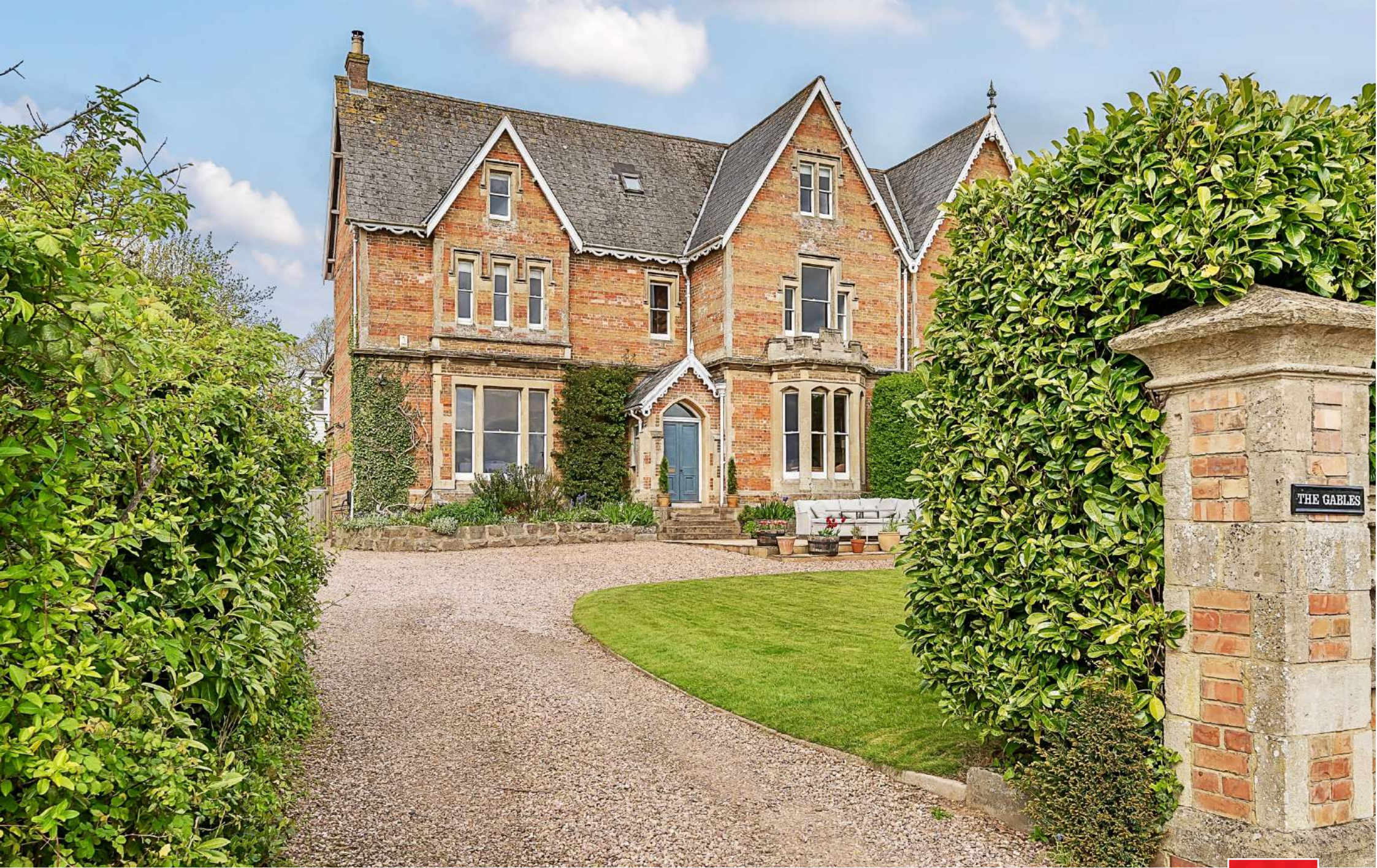
The Gables Private Road, Staplegrove Road, Taunton TA2 6AJ