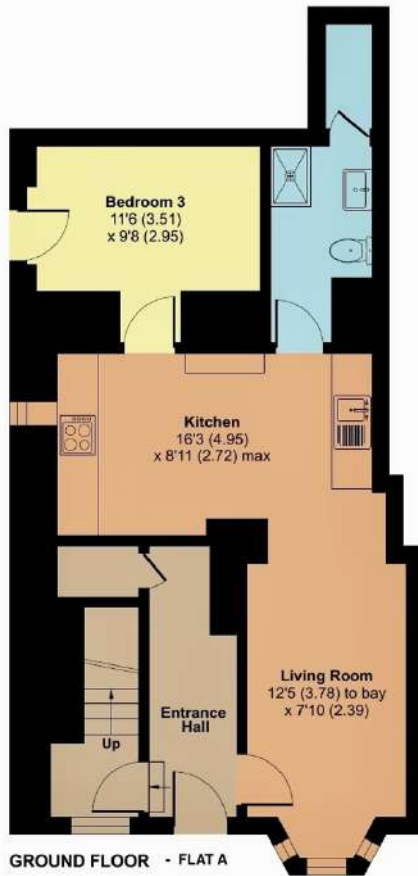
GROUND FLOOR - FLAT A