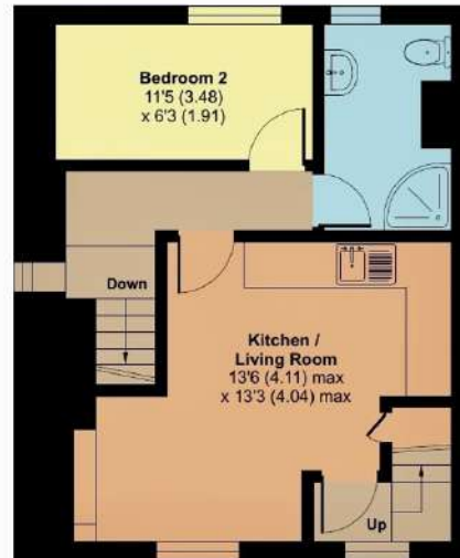
FIRST FLOOR - FLAT B