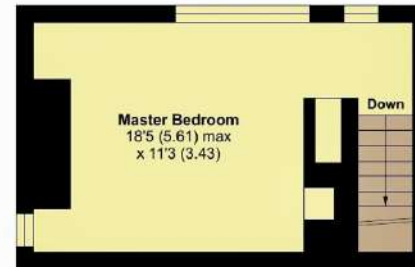
SECOND FLOOR - FLAT B