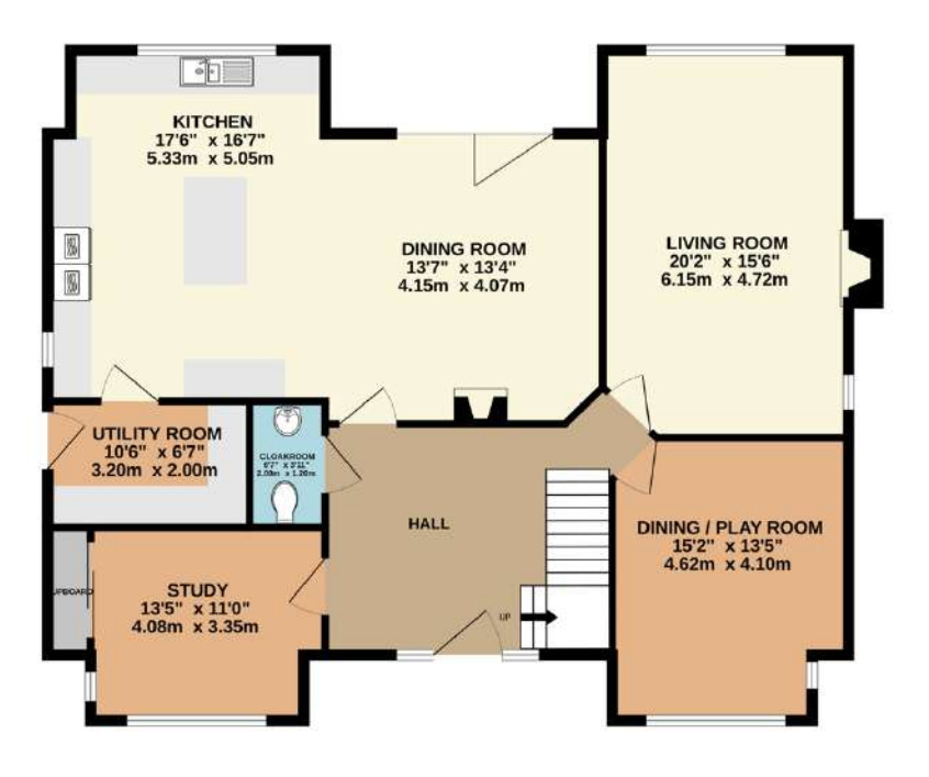
1ST FLOOR 1195 sq.ft. (111.0 sq.m.) approx.

GROUND FLOOR 1311 sq.ft. (121.8 sq.m.) approx.