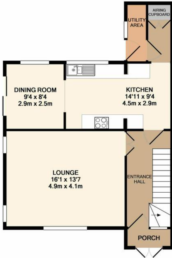
GROUND FLOOR APPROX. FLOOR AREA 601 SQ.FT. (55.9 SQ.M.)