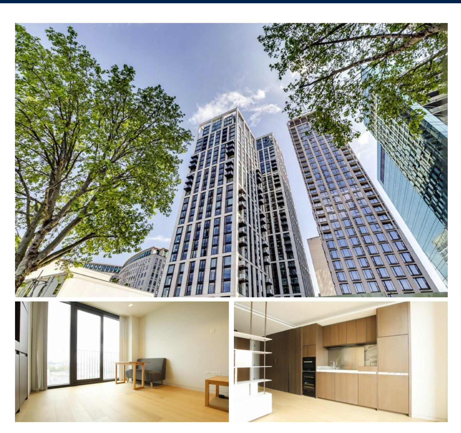
Casson Square, SE1