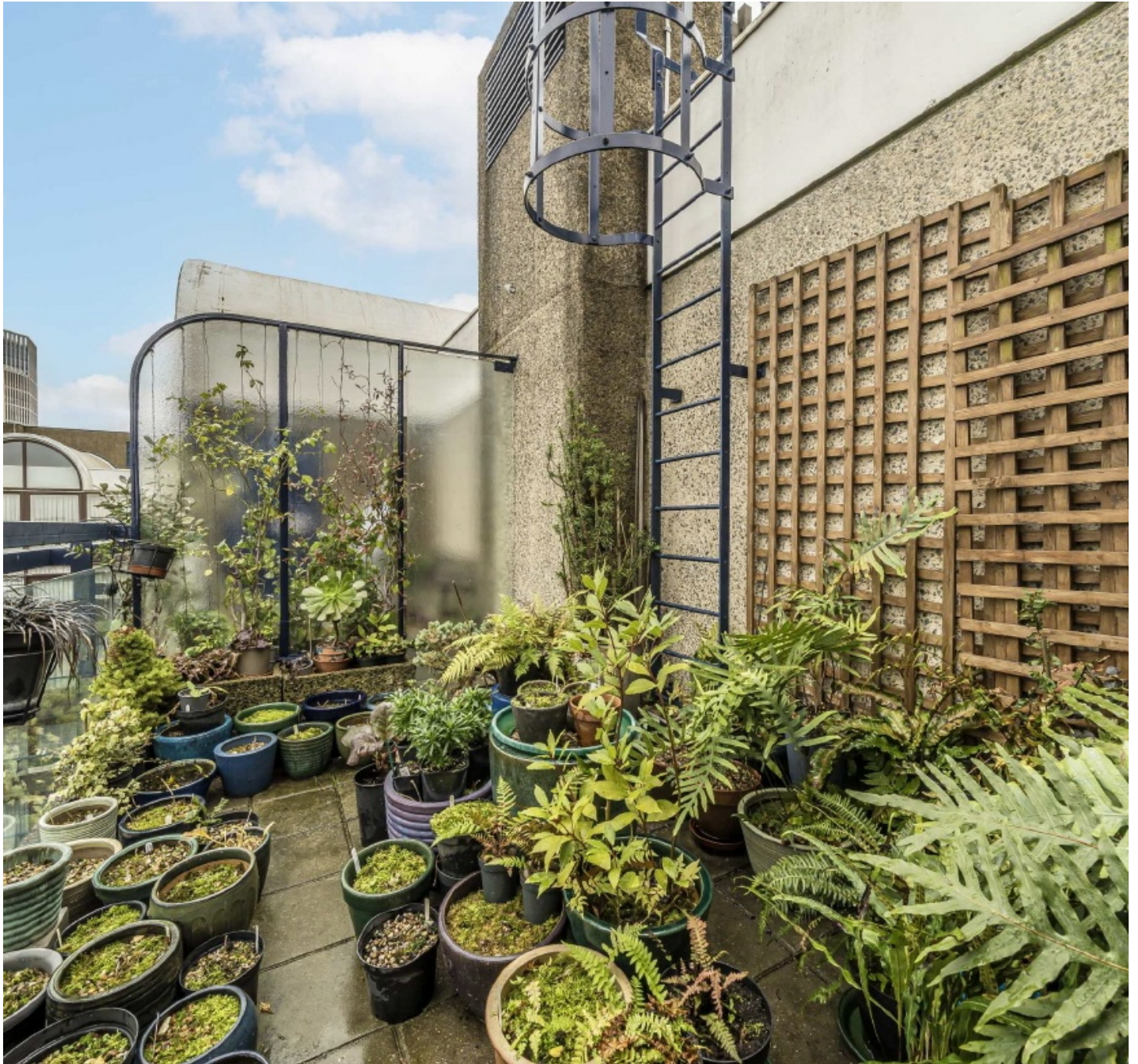
Ben Jonson House, Barbican, EC2Y