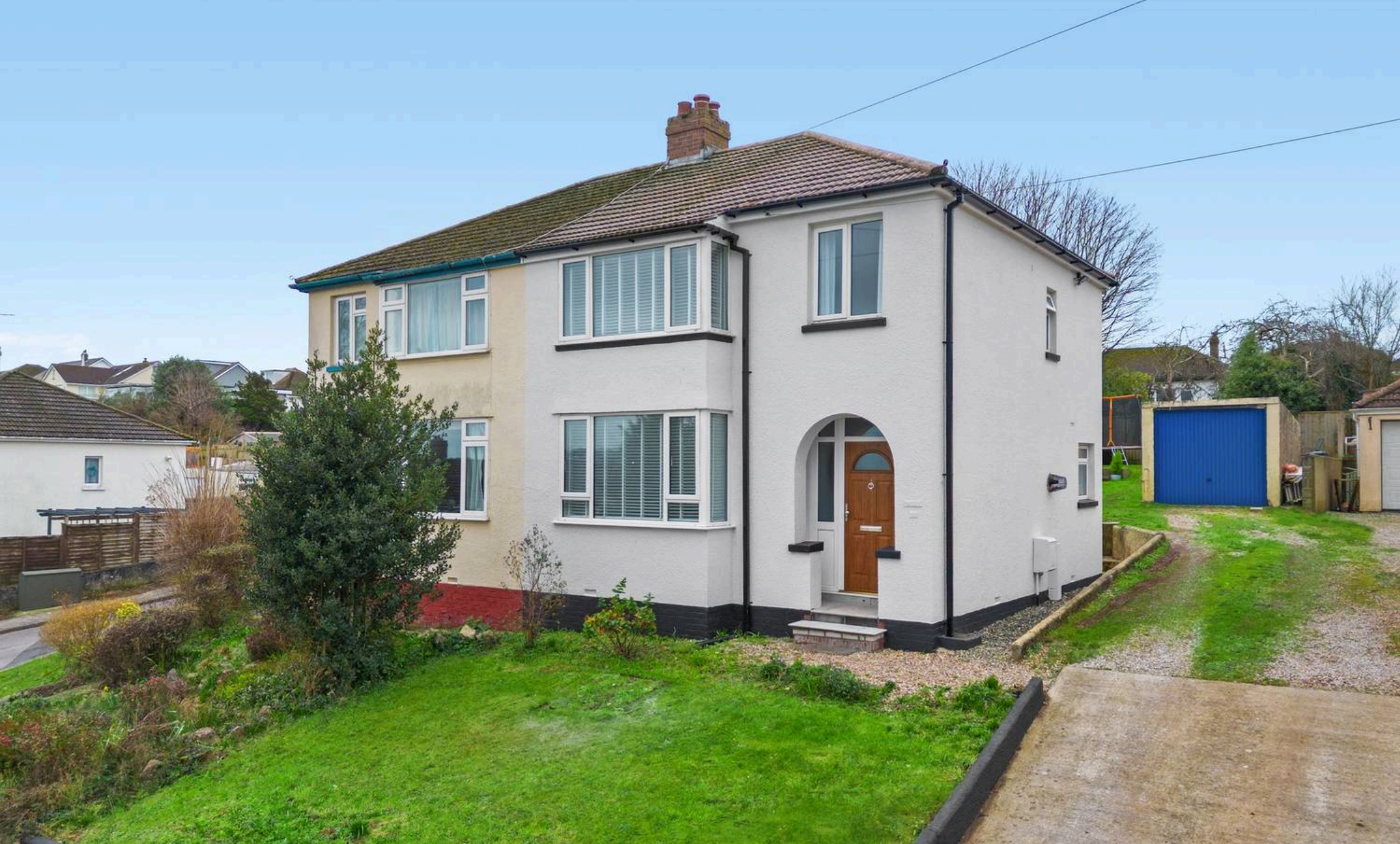
Tresco, Highland Road, Torquay – TQ2 6NH £290,000