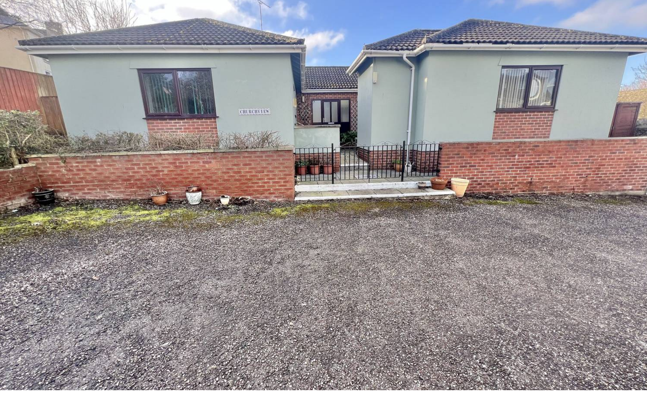
Churchview, St. Margarets Close, Torquay - TQ1 4NR