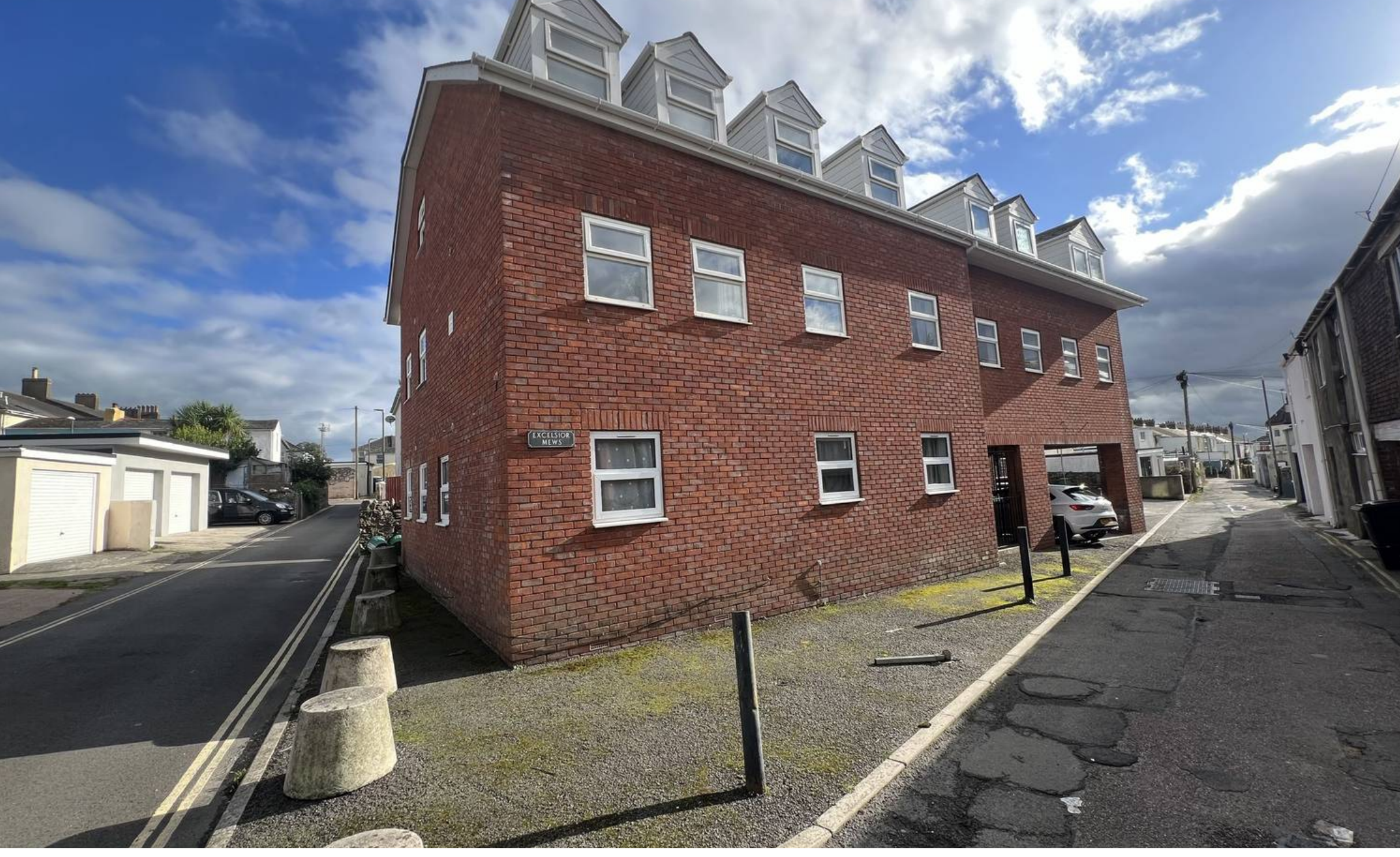
Flat 7, Excelsior Mews Fortune Way, Torquay - TQ1 3PG Guide Price £79,950