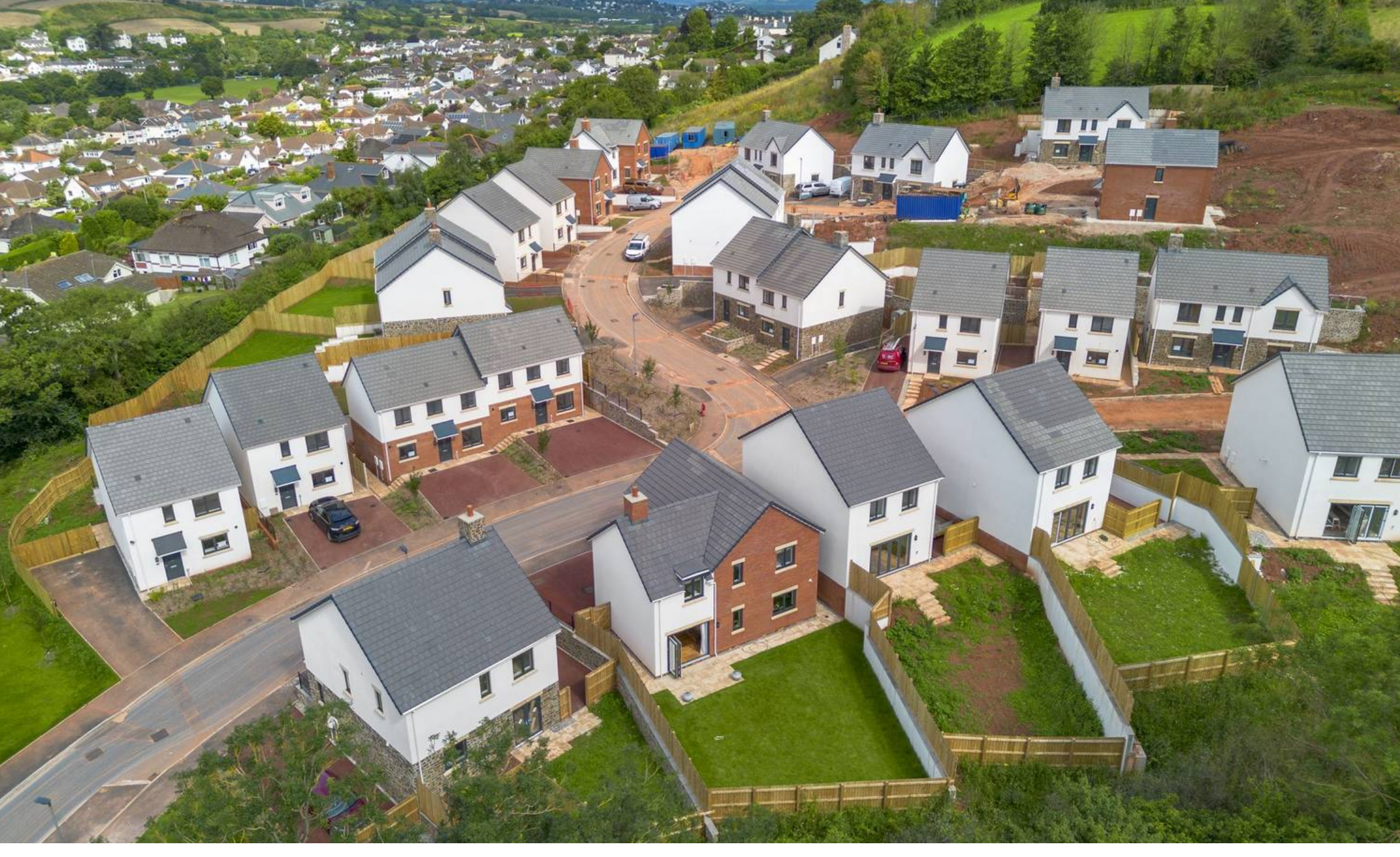
Plot 6, Karsbrook Green, Kingskerswell - TQ12 5JS Guide Price £365,000