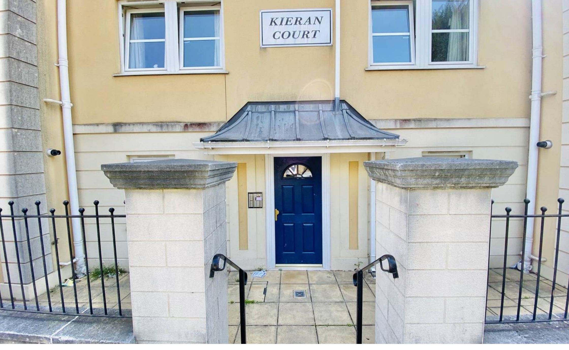
13 Kieran Court, 53 Upton Road - TQ1 4AH £105,000