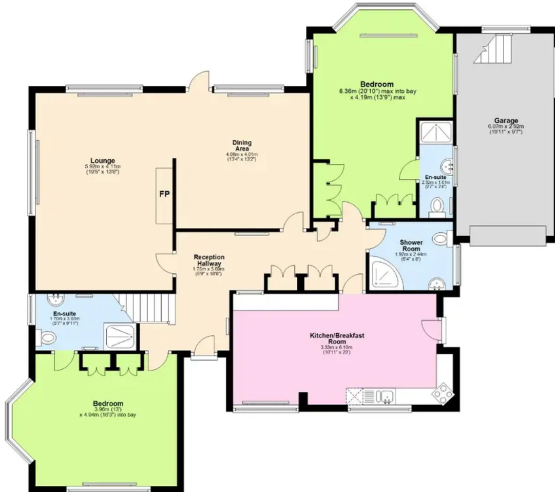
Ground Floor Approx. 150.3 sq. metres (1618.3 sq. feet)