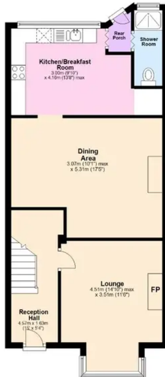
First Floor Approx. 42.4 sq. metres (456.2 sq. feet)