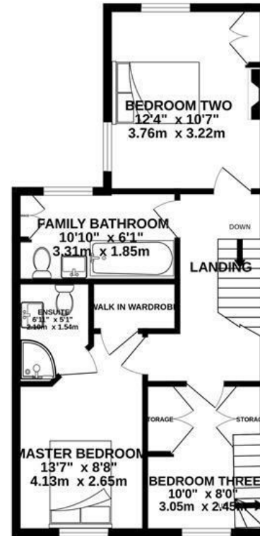
1ST FLOOR 511 sq.ft. (47.5 sq.m.) approx.