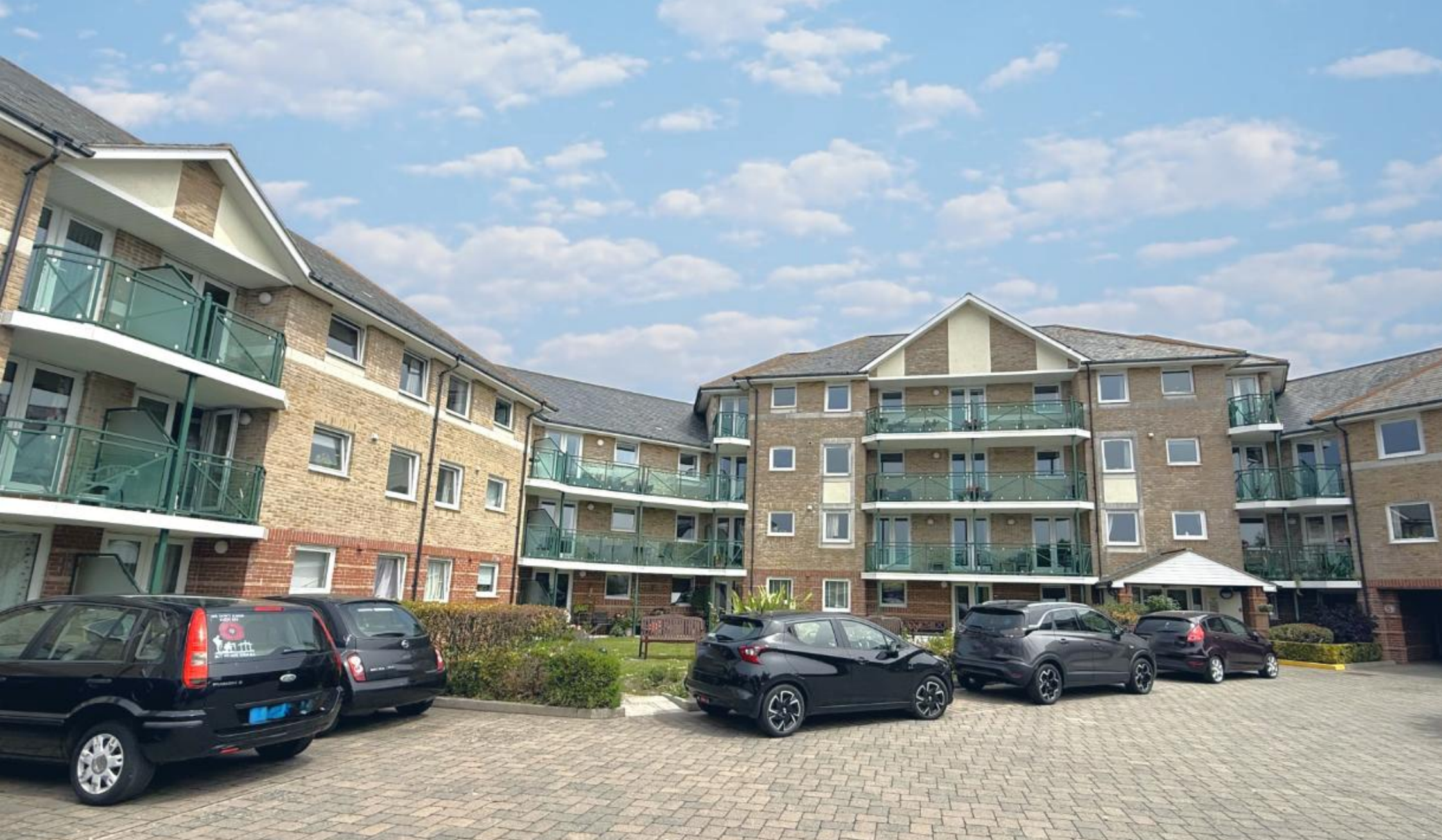
Swannery Ct, Weymouth, DT4 7TY £130,000 Leasehold