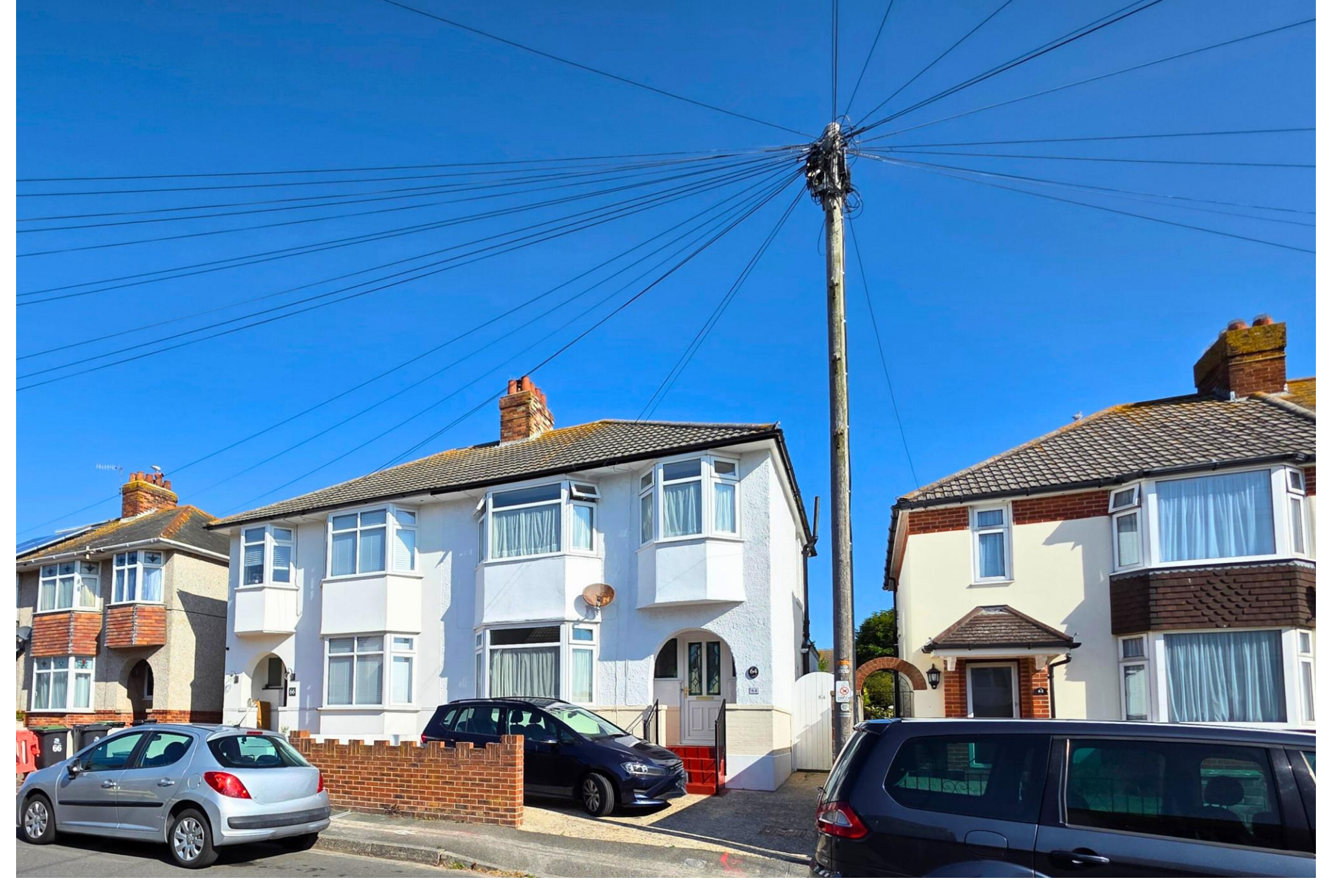
64 Wardcliffe Road, Weymouth, DT4 0HP Asking Price Of £340,000 Freehold