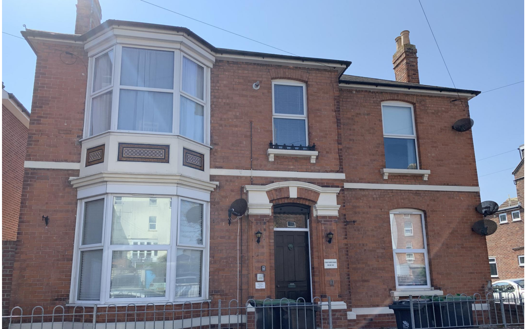
Grange Road, Weymouth, DT4 7PQ £155,000 Leasehold