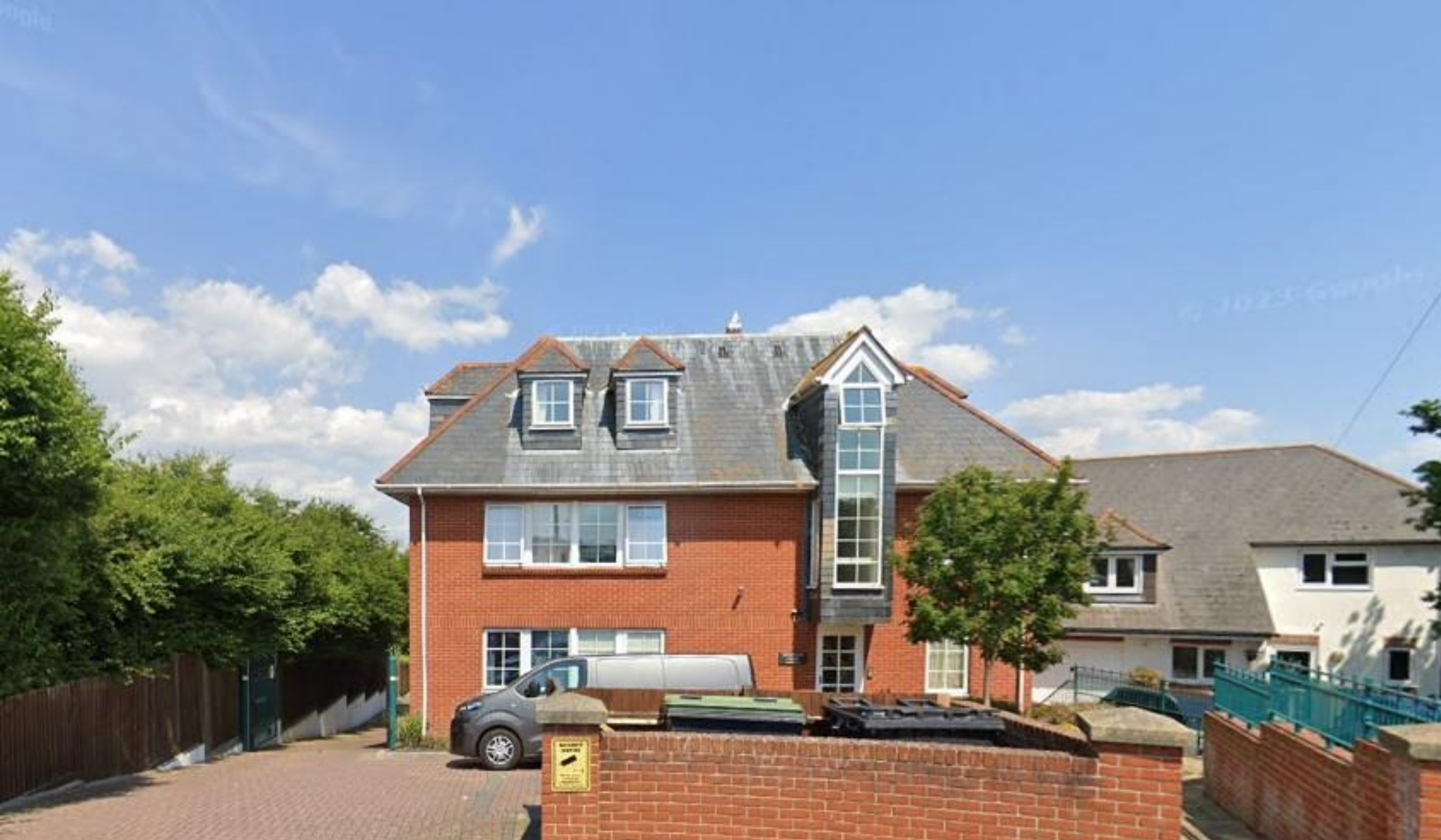
Kingfisher Court, Goldcroft Avenue, Weymouth, DT4 0FD Asking Price Of £175,000 Leasehold