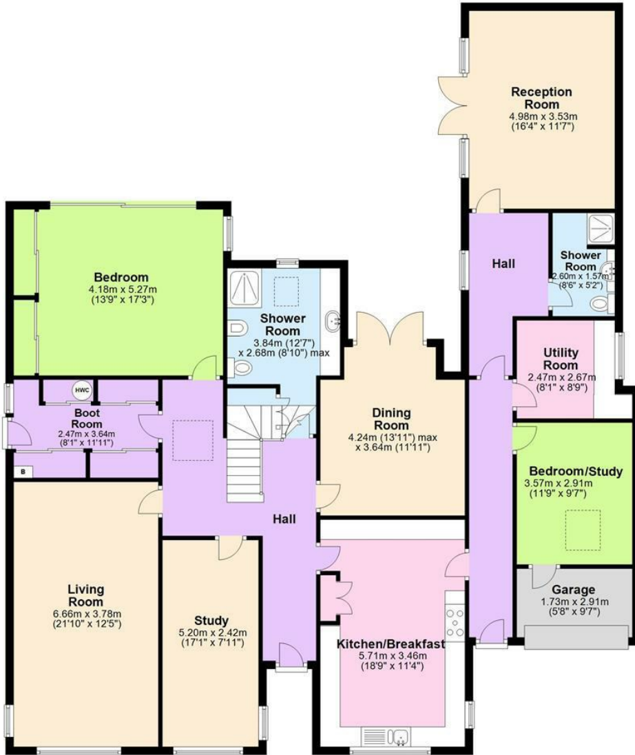
Ground Floor Approx. 192.6 sq. metres (2072.9 sq. feet)