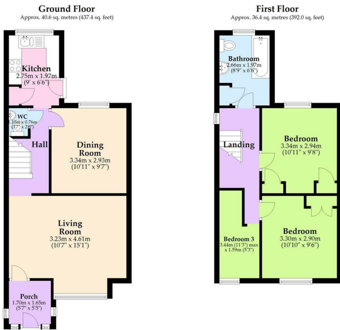
Total area: approx. 77.1 sq. metres (829.4 sq. feet)