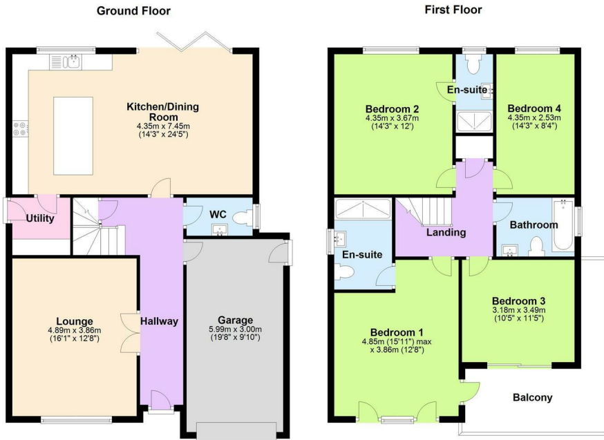
Total area, not inc. Garage or Balcony approx. 151.8 sq. metres (1634 sq. feet)