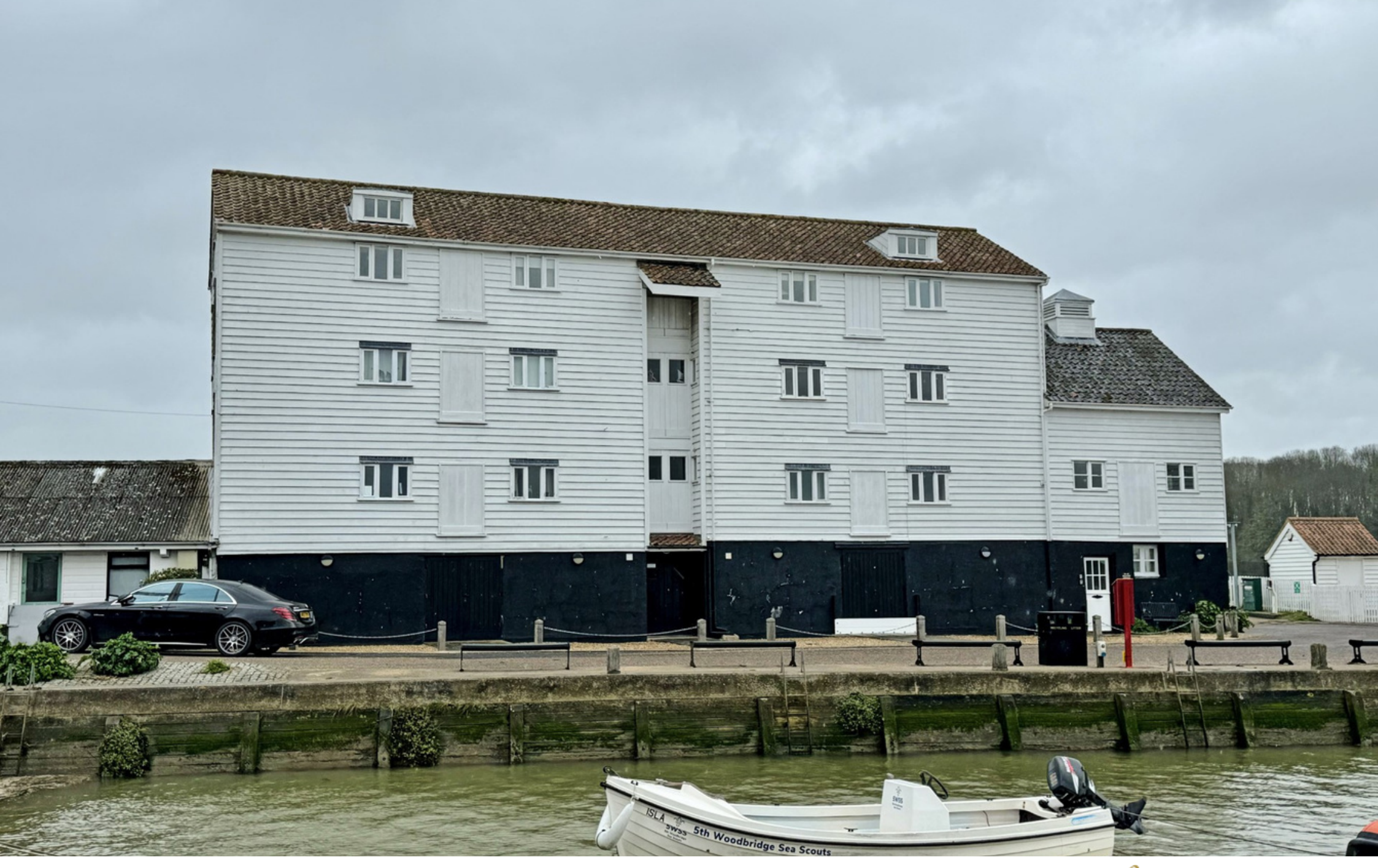
Flat 2, The Granary Freehold Guide Price £ 260,000 Tide Mill Way | Woodbridge | IP12 1BY