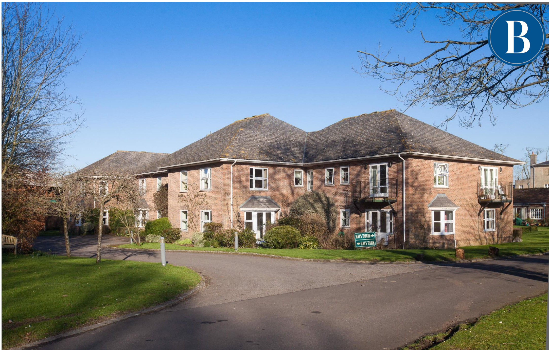
Hays Park, Sedgehill