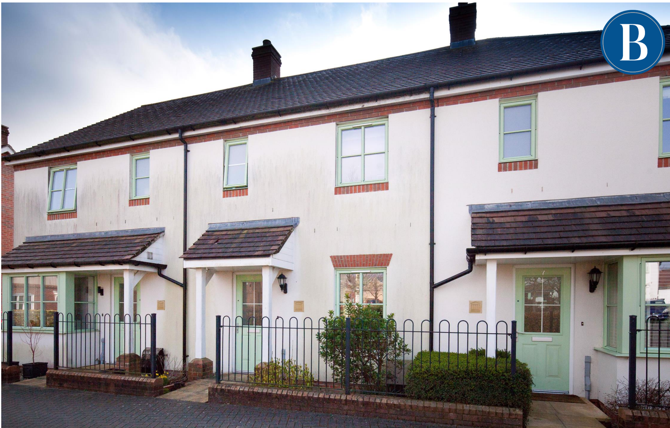
The Rickyard, Shaftesbury