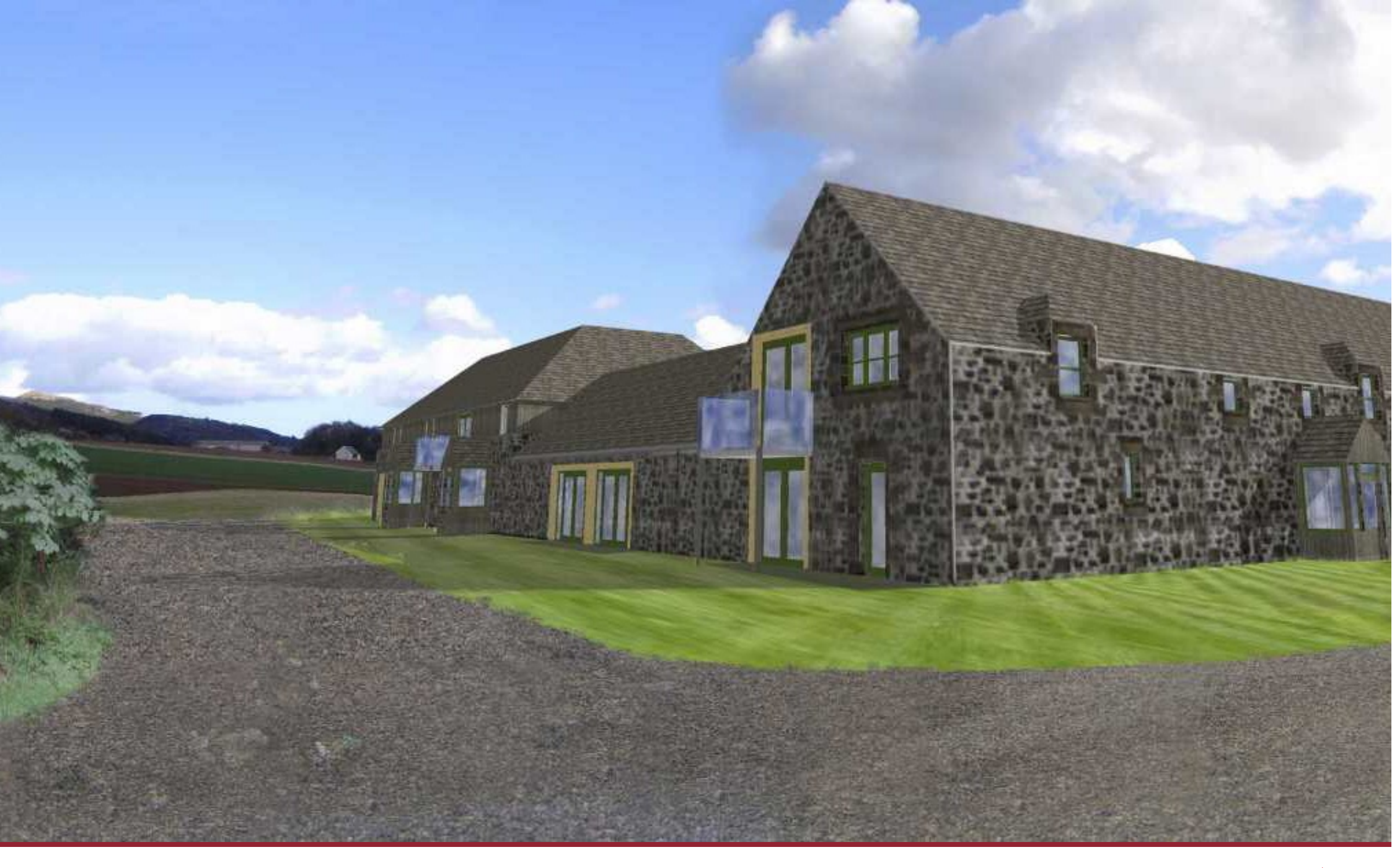
Blinkbonny Steading, Plot 4 | East Of Lindores | KY14 6JE