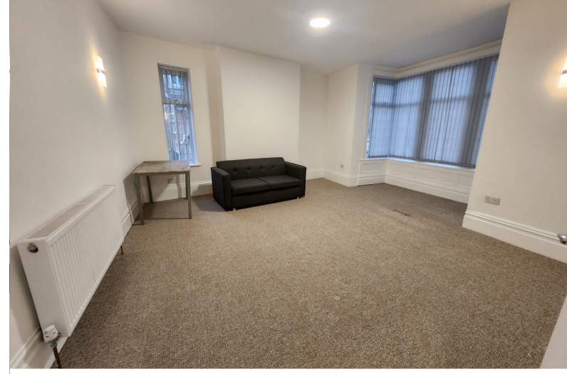
Asking Price £265,000