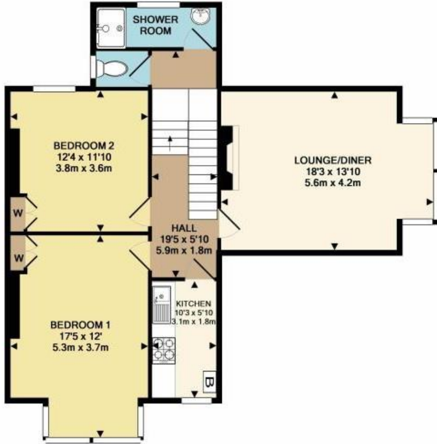
1ST FLOOR APPROX. FLOOR AREA 797 SQ.FT. (74.1 SQ.M.)