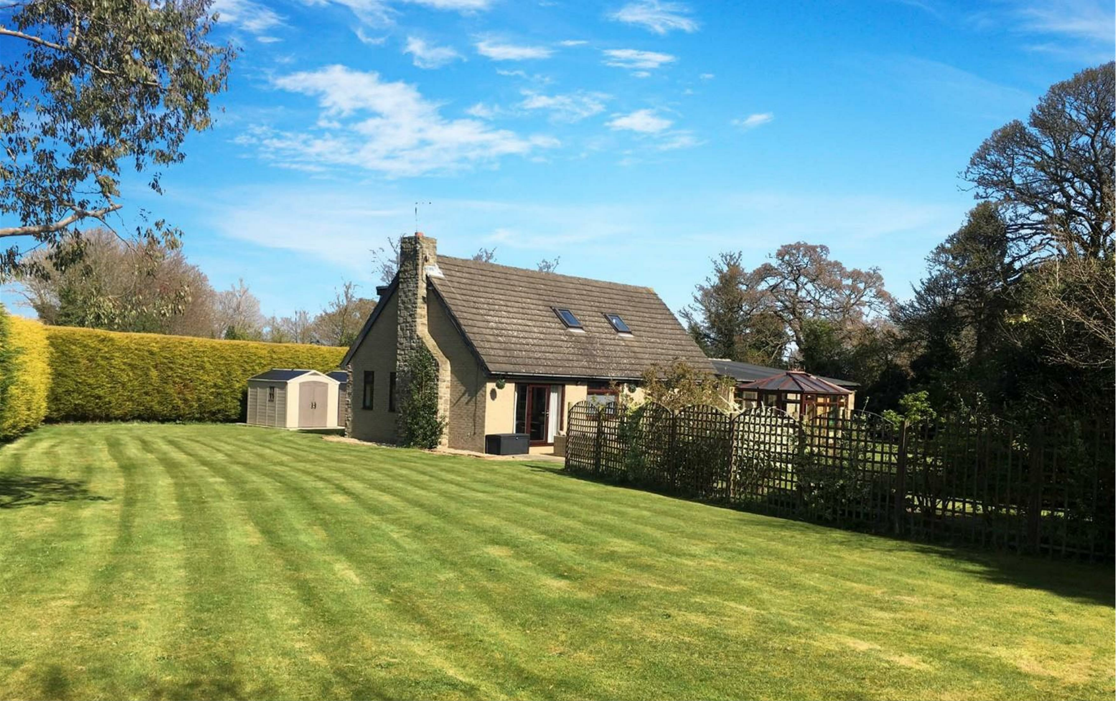
📍 Field House Close, Morpeth NE61 6LU