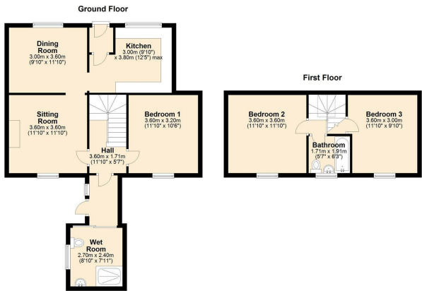
The Rowans, Brora