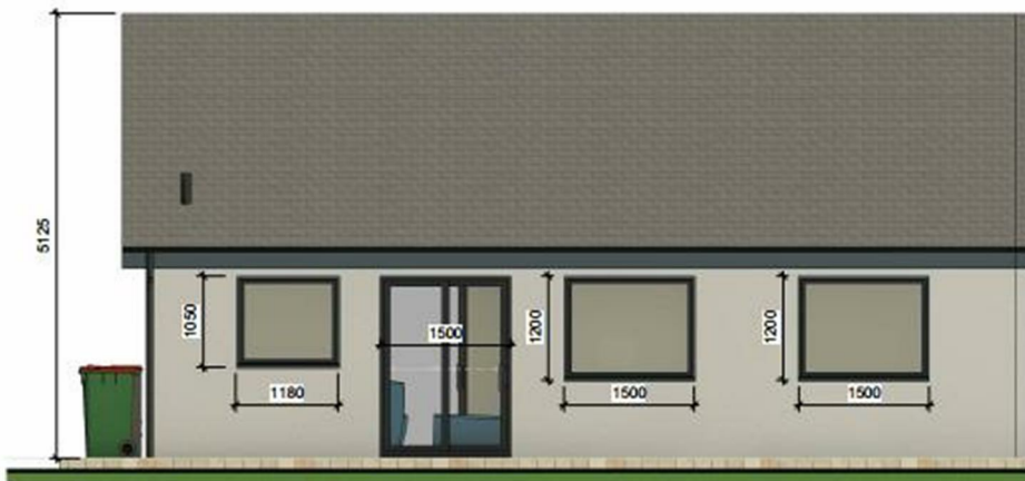
2 East Elevation Plot 2 1 : 50