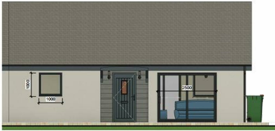
3 West Elevation Plot 2 1 : 50