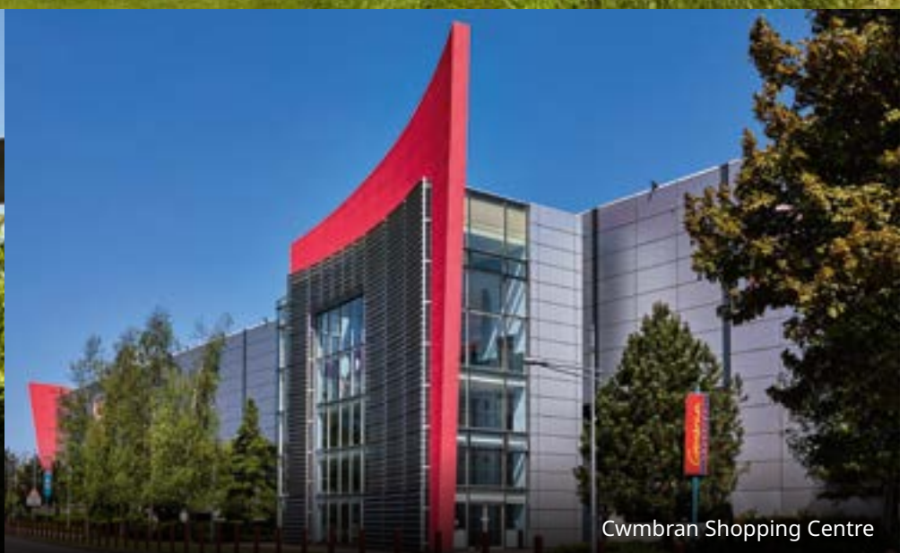
Cwmbran Shopping Centre