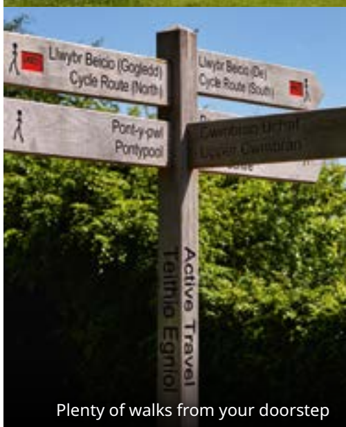
Plenty of walks from your doorstep