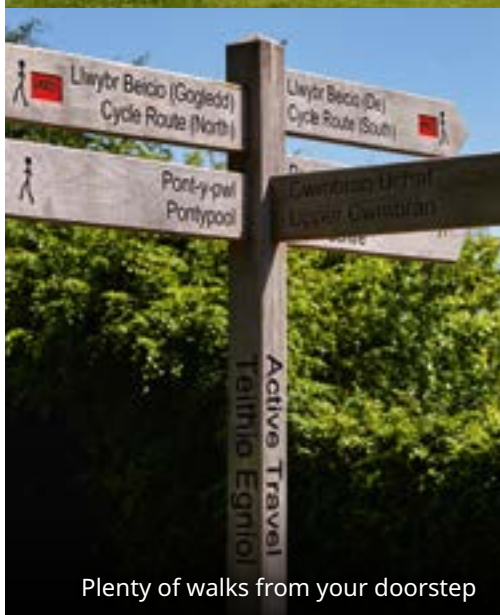
Plenty of walks from your doorstep