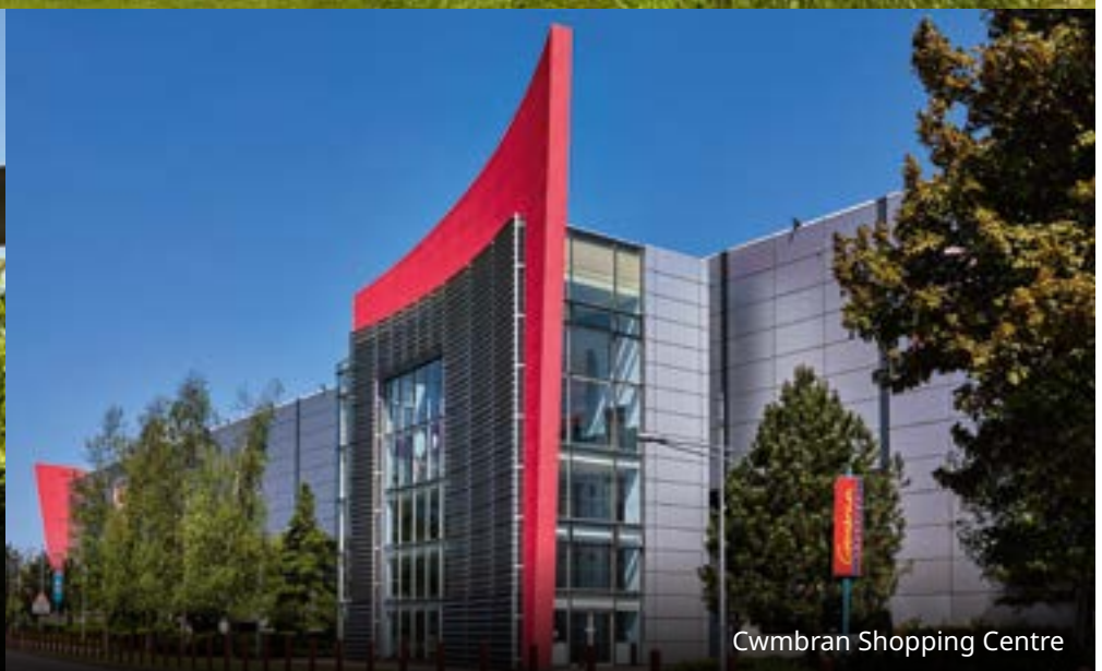
Cwmbran Shopping Centre