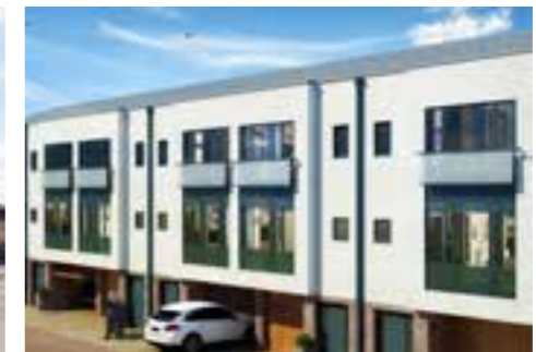
14 light, spacious and contemporary townhouses will stand adjacent to the original mill at The Bread Factory. These impressive homes benefit from three bedrooms, private parking and bespoke kitchens and bathrooms.