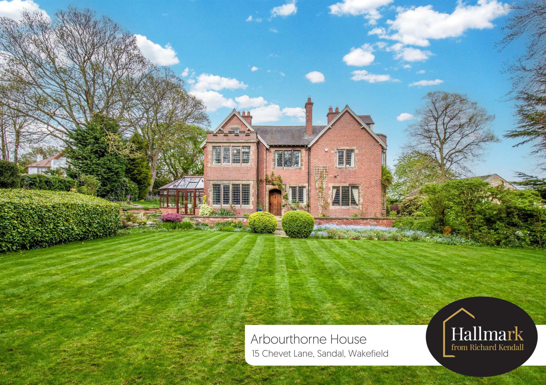
Arbourthorne House 15 Chevet Lane, Sandal, Wakefield