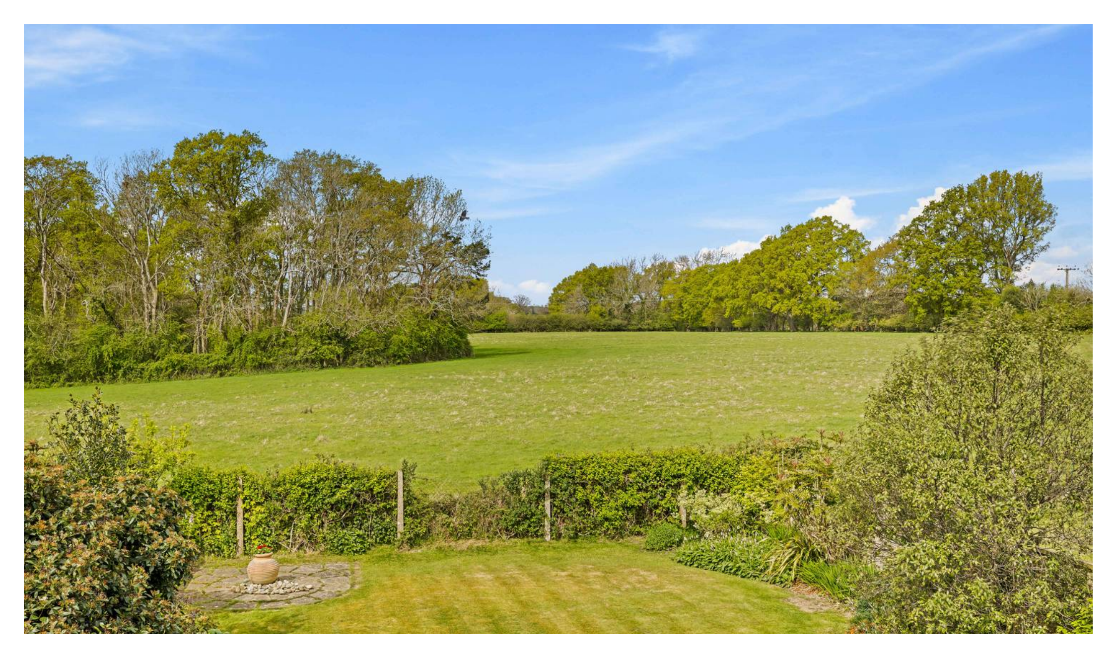
Cole's Estate Agents

56 High Street, East Grinstead - RH19 3DE