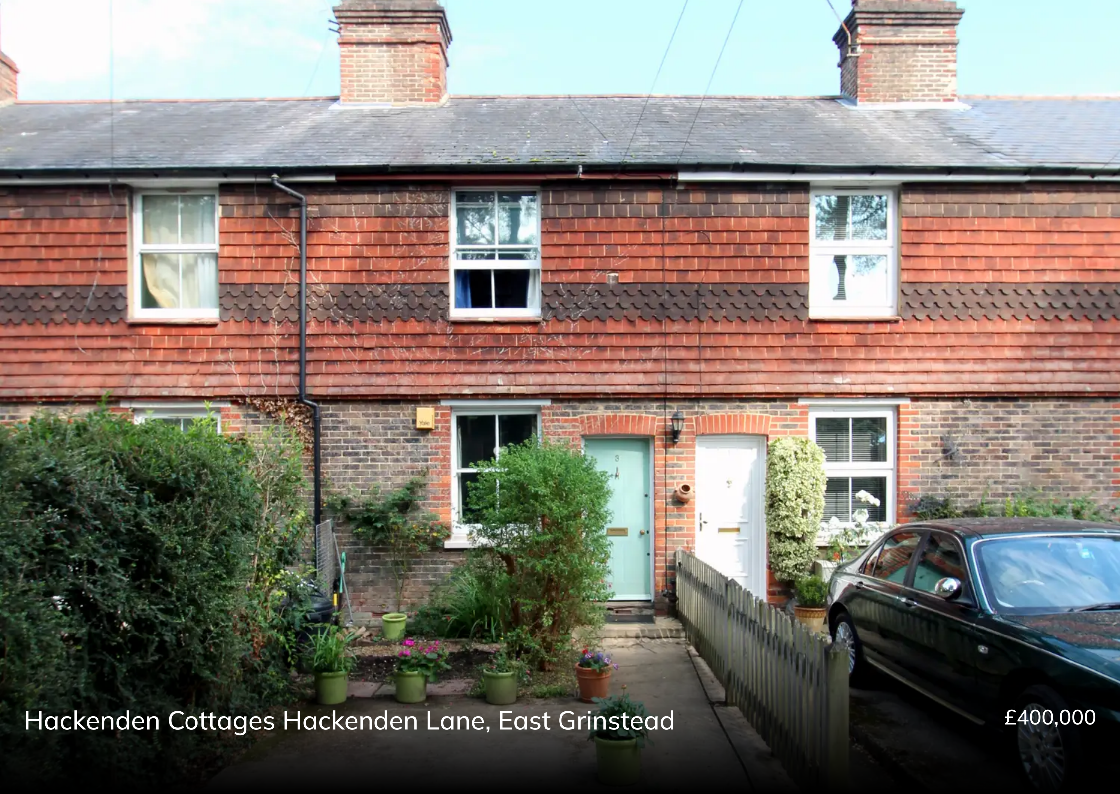
Hackenden Cottages Hackenden Lane, East Grinstead