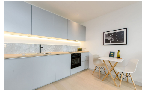
Omega Works, 4, Roach Road £425,000