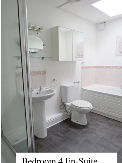
Bedroom 4 En-Suite