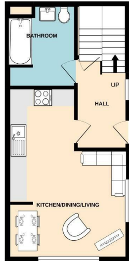
GROUND FLOOR 357 sq.ft. (33.2 sq.m.) approx.