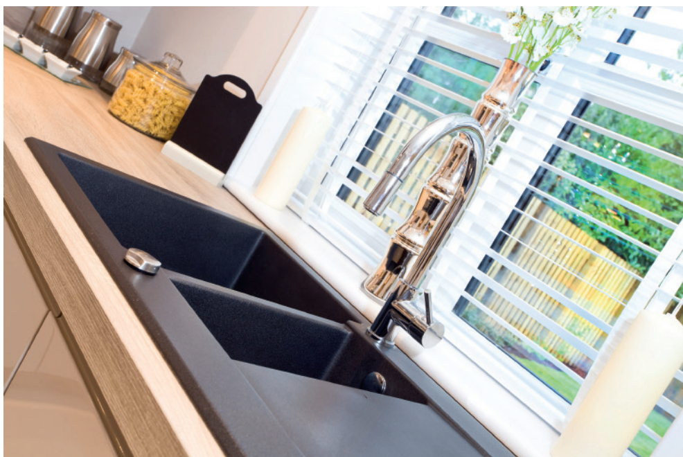
BLANCO KITCHEN SINKS