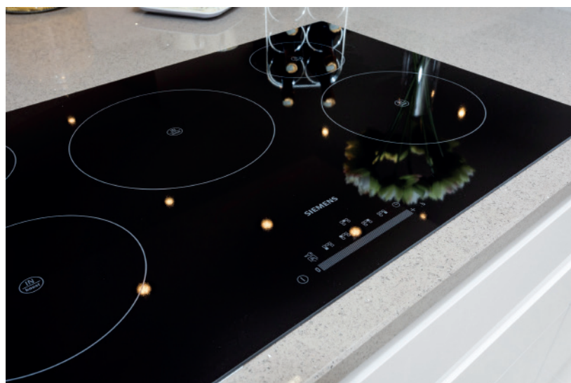
HIGH QUALITY APPLIANCES