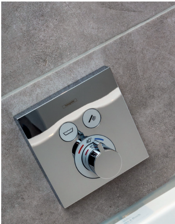
HANSGROHE POLISHED CHROME BRASSWARE