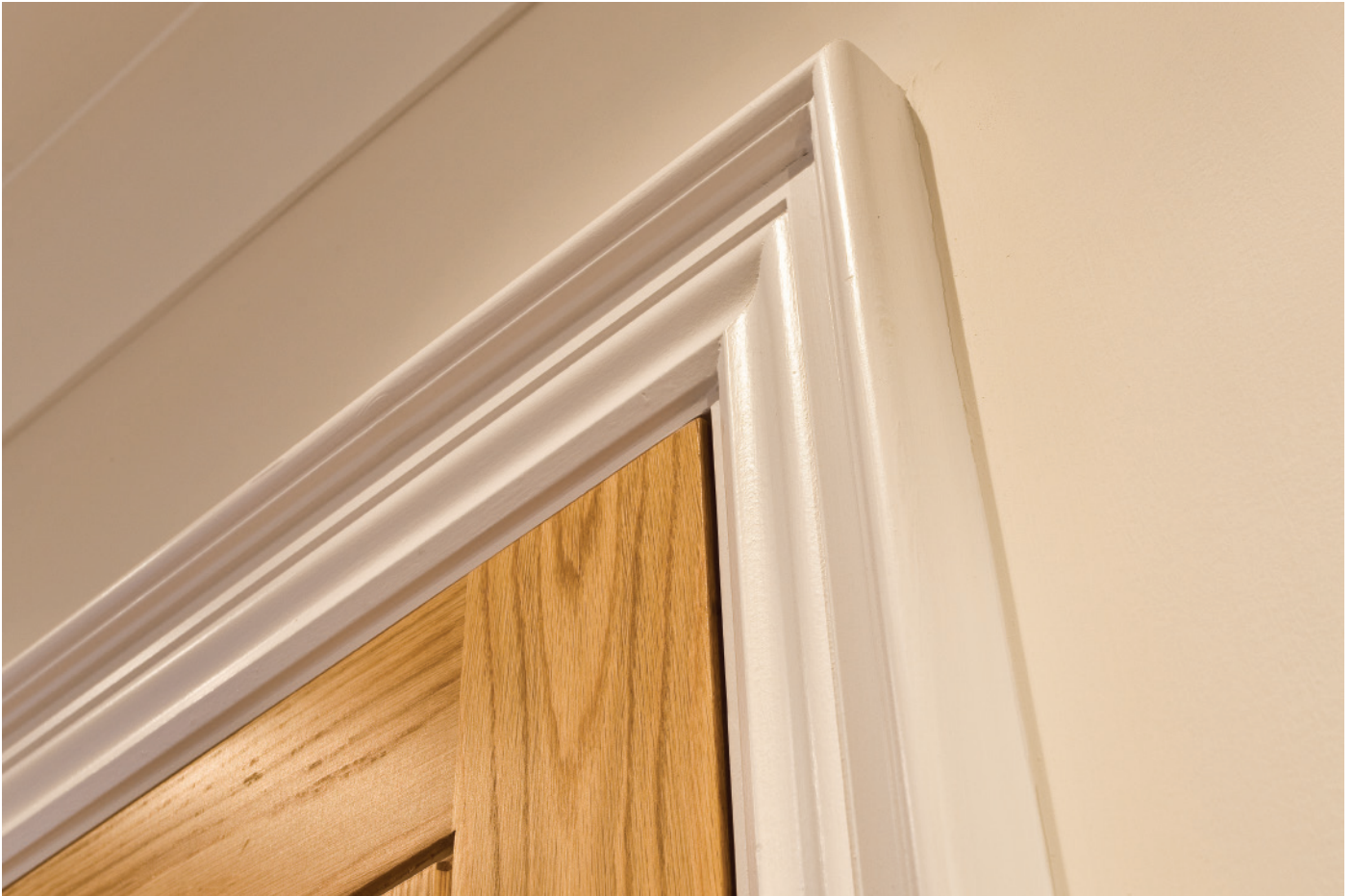
FEATURE ARCHITRAVE & SKIRTING BOARDS